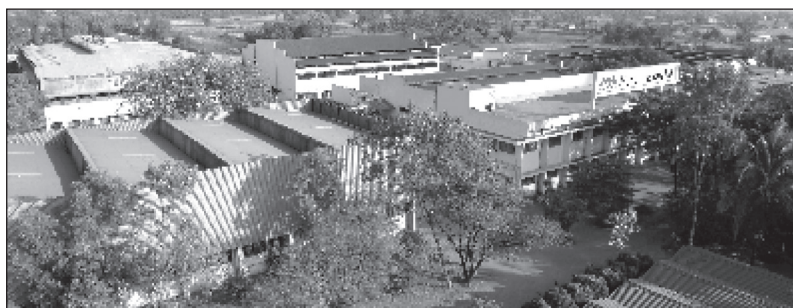
Menon Pistons Limited main manufacturing facility at Kolhapur.